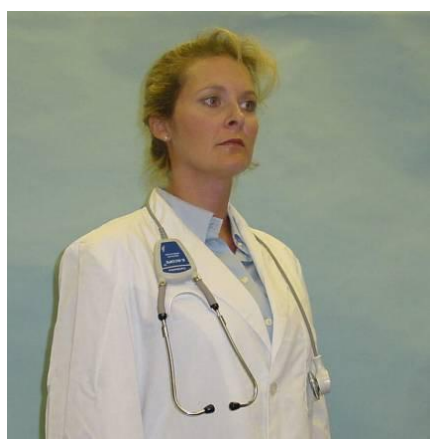
Figure 3 Wearing the E-Scope

The Belt model E-Scope is designed for use with an ITE (in-theear) type hearing aid or with an "open fit" type BTE hearing aid. With the belt model E-Scope, the normal earpieces have been removed. A pair of headphones are then inserted into the upper output of the E-Scope and placed over the hearing aids. Figure 2 shows the detail of the Belt model E-Scope and Figure 4 shows the E-Scope in use.