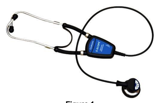
Figure 1 E-Scope II Electronic Stethoscope Clinical model

There are several models of the E-Scope II, including the clinical E-Scope (cat. no., 718-7700) and the belt model E-Scope for hearing impaired users (cat. no., 718-7710).