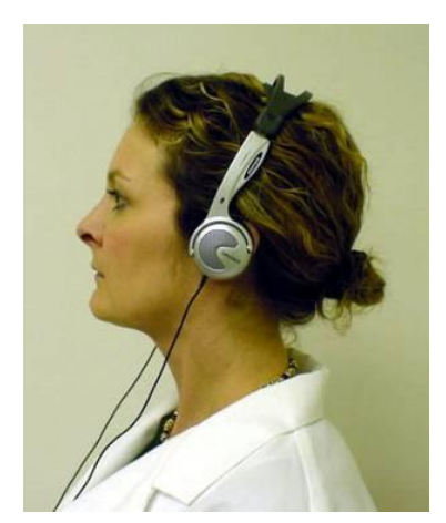
Figure 5. Cat. No. 718-0405 Over-the-head style headphones with external volume control.

These headphones are designed for use with the E-Scope Belt model, cat. no. 718-7710