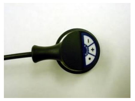
Figure 8 E-Scope Stethoscope head

The E-Scope volume may be increased or decreased by momentarily pressing the + or – button located on the stethoscope head. Pressing and holding one of these buttons for more than one second causes the volume to move up or down. It takes about seven seconds for this automatic adjustment to cover the full volume range of 64 steps. The E-Scope retains the last volume setting and reverts to that setting when the power is turned on.