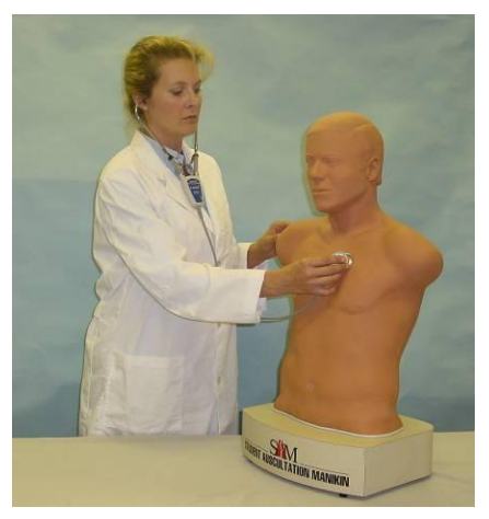
Figure 4 – Using the E-Scope