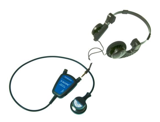
Figure 2 E-Scope belt model for hearing impaired users With Convertible style headphones