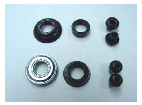
Figure 7 Accessory Pack Supplied with all E-Scopes

Each E-Scope is supplied with an Accessory pack that contains a pediatric diaphragm, plastic adult bell, plastic pediatric bell and plastic infant bell. These chest pieces can be used by replacing the existing chest piece by unscrewing. Additionally, this pack contains both mushroom and hard plastic ear tips. Inserting he mushroom ear tips will require a little force. The hard plastic eartips are self-threading. Place this eartip on the stethoscope binaural, press and with a twisting motion, screw them on.